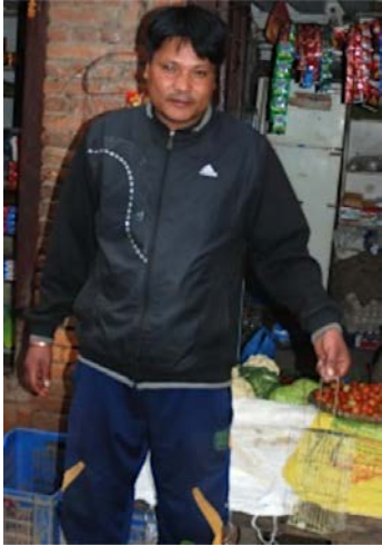
13. Asan merchant with living trap containing a mouse, heading out to release it

the louse supercedes causing suffering to the anonymous human stranger.