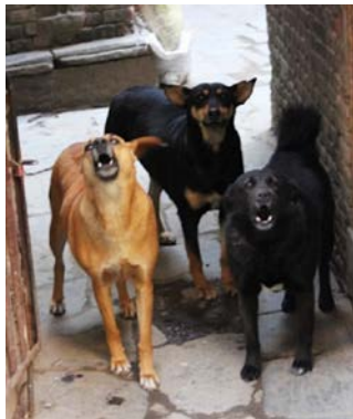
5. Street dogs guarding a back courtyard

Feral dogs are ubiquitous. Some family pets also provide security for courtyards and homes by their bark and