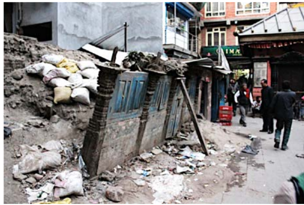
6. Crumbling medieval buildings and modern concrete homes

It is always interesting to take rambling walks down the roads and gullies of the Newar cities; they are a rich assembly of architectural virtuosity in various states of repair, courtyards full of human and animal life, small manufacturing workshops, and all the exchanges and struggles that are at play in a poor yet expanding Asian city . . . with its shopkeepers, street sellers, migrant workers, hustlers, beggars, tourists . . . and those whose tea and sweets shops, bars, and basic restaurants seeking their own subsistence trying to provide for their sustenance.