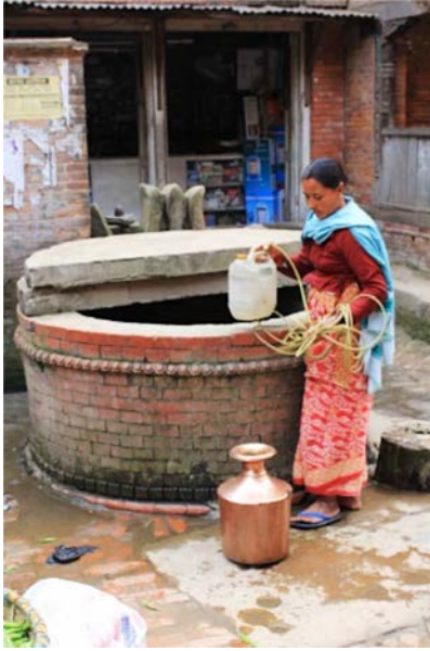
7. Hundreds of wells still provide drinking water for the poor

Old wells and the remnants of a medieval aqueduct public tap system still must serve the needs of urban Newars today. Hence, every-