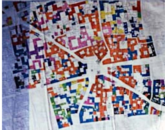
1. The Asan Tol Market Community

In most neighborhoods, houses continue to rise ever higher as the population of the Kathmandu Valley has grown seven-fold since 1980. The largest of the Newar “pre-industrial cities” (Kathmandu, Patan, Bhaktapur) were also regional trade entrepôts since the time of their origins, and their arts