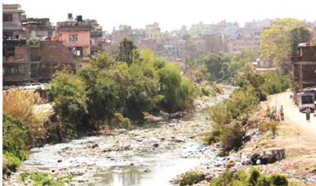
8. The Vishnumati River. Once a source of ritually pure water, it is now dangerously polluted

each home, regularly used to discard offerings made in home rituals, especially foods. The Vishnumati River that flows along the western city boundary also receives specially designated religious discards, from major rituals as well as cremation ashes. Once used as the source of flowing water necessary for ritual purification ( ni la: ) in household rituals and to wash away death pollution, this river now, like all rivers in the Valley, has been so utterly polluted by garbage dumping (domestic and industrial) that it is biologically dead and dangerous to human health.