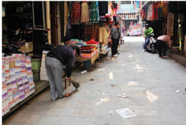
2. Cleaning a market alley

and artisans flourished. Agricultural fields once surrounded Newar towns and their farmers grew rice and a variety of vegetables in its very fertile, irrigated soils. Villages across the Valley and beyond provided a ready supply of goats, water buffalo, and cows in the city’s urban mar-