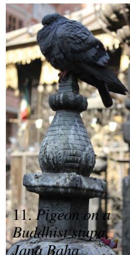
11. Pigeon on a Buddhist stupa Jana Baha

Most Newars, Hindu or Buddhist, subscribe to the belief that one should make good karma, or merit, by acts of kindness to living creatures, with the archetypal act of this sort a gift of food; and on the other side of the ledger, one should kill living