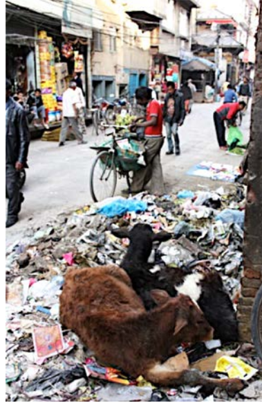
4. Cows as foragers of urban refuse

Newar urban life, even in large farming villages, is built with houses side by side, as people prefer to live in connection with each other both literally and figuratively. Domesticated animals are often present: cows stabled in houses graze in the evenings; goats and sheep are brought in to be sold for butchering; and chickens and ducks are kept by families in their courtyards, eventually headed for market or the family table.