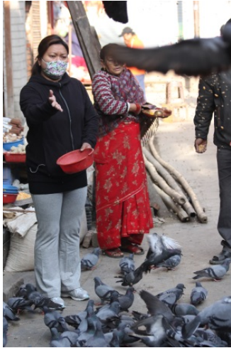
12. Feeding pigeons in Jana Baha

On the feeding side, the most common practice by householders is to feed pigeons and do so prodigiously. In the central Buddhist temple of the city, Jana Bāhā, the buying of grain from vendors for feeding these